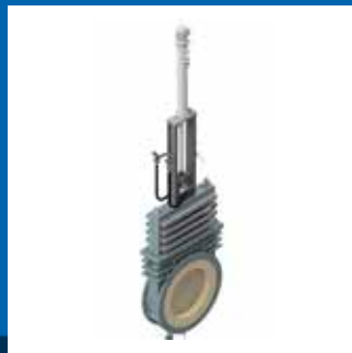
HOT BLAST VALVES (ENERGY SAVING)