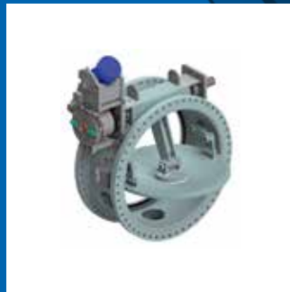
GUIDE LEVER VALVES