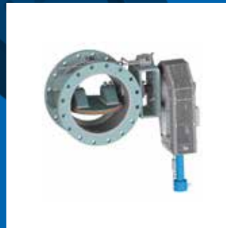
DOUBLE ECCENTRIC VALVES