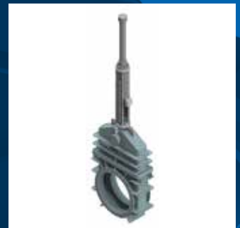
WEDGE GATE VALVES