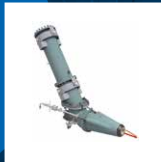
TUYERE STOCKS (ENERGY SAVING)