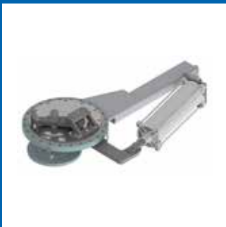
DUST DISCHARGE VALVES